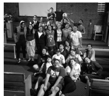
Papatoetoe and St. John's Hamilton

I've had the chance to touch base with a lot of parishes over the last month. Between invitations to speak at multiple services, combined youth nights, Youth Rally's, workshops, meetings with youth groups, retreats, camps and a host of ecumenical events and encounters, I haven't had much of a chance to pause and reflect! It doesn't stop there though, with a number of other important events relating to children and youth on the horizon. I ask that you continue to keep me busy – I am always looking for more and more opportunities to interact with you all!