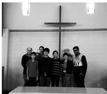
St. Lukes Northcote Youth

On the grass root level of parish life, it is so important for us to honour and value our children and youth ministry workers and the tireless amounts of work they do. We give each and every leader and ministry worker thanks, and continue to commit to uplifting young people through our service to one another.