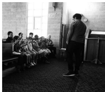
Northcote Takapuna Sunday School