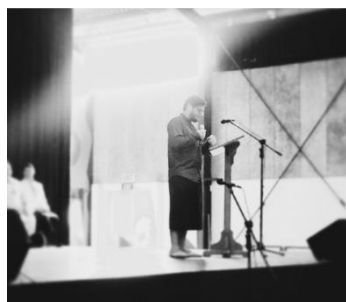
Sinoti Samoa Tupulaga Camp